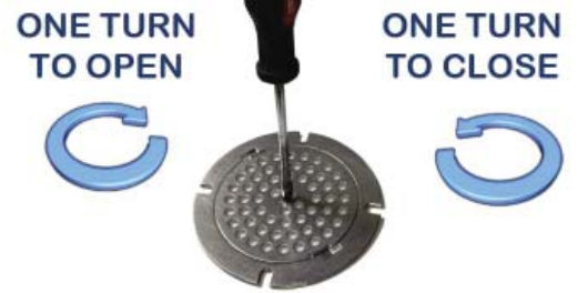
“Easy Open” Floor Drain Cover

Drain DEFENDER’s new and advanced drain conditioning system replaces your existing floor drain cover with our unique, interactive, drain cover-basket system.